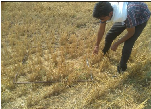
Plate 2: Measurement of straw population

Initial straw population of wheat crop was calculated using a square frame of area 1x1 meter placed randomly in the field where the operation was performed (Xia et al. , 2014) [10]. Seven samples were taken for each replication and then average value of straw population was calculated. 1 m 2 area is shown in Plate 2.