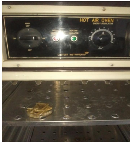
Plate 1: Measurement of moisture content of straw