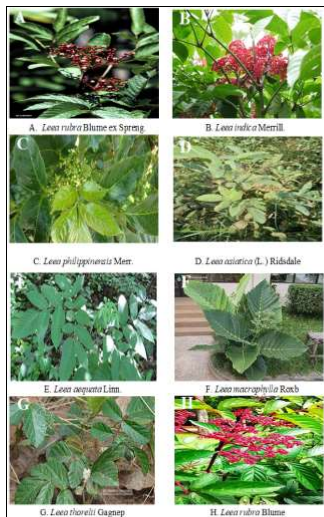
Fig 1: Medicinal Plants of the genus Leea

in vertigo [15, 18]. Other than this, dried leaves are consumed as a tea drink considered effective against cancer [35]. Leea guineense and Leea macrophylla was used to treat cancer disease [8]. The leaves of Leea guineense are used against cancer. The roots of Leea thorelii are mainly used as a tonic [19]. Leea aequeta is known as tetanus plant. Leea aequeta is used in itching, and dyspraxia. Its leaves and twigs are used as an antiseptic to treat wounds [20]. Previous research has shown that the stems, seeds, and roots of Leea aequeta have antibacterial activity. Leea aequeta is used to treat wounds, and skin diseases [19]. Leea rubra is a useful indoor plant. It may have medicinal properties [21]. The leaves of Leea rubra are used as antipyretic, antitumor, antibacterial, and diaphoretic agents. It is used to treat rheumatism, arthritis, and stomach ache etc [22]. Leea philippinensis are often used as ornamental plants because they help to attract pollinators, and birds to gardens [23]. There is little data available regarding its biological use. However, other species of the genus have been used traditionally to treat a number of diseases [24]. The whole plant poultice of Leea philippinensis is Merr. is active against bacteria [25]. The medicinal plants of genus Leea shown in Figure 1.