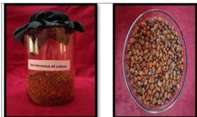
Plate 1: Maintenance of culture of C. maculatus