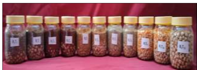
Plate 3: Cereals and kabuli gram kept in layers in bottles to study effect on infestation and development of C. maculatus