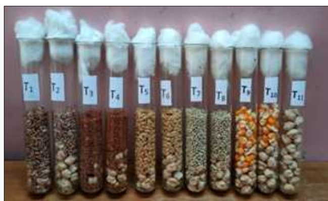
Plate 2: Experimental setup to record the movement of female C. maculatus in different treatments