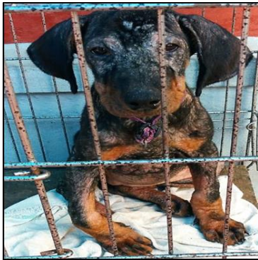
Fig 2: Day 1: Lesions suggestive of generalised demodicosis