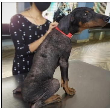
Fig 3: Week 4: Hair regrowth and reduction in intensity of lesion