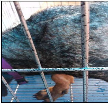
Fig 1: Day 1: Folliculitis and alopecia Tab. Bravecto (250 mg) was given