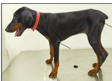
Fig 4: Week 8: Lesions limited to thigh and elbow joints