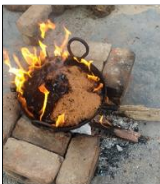
Burning of Herbs

dipped in water with the ratio of 1:6 (weight / volume). The mixture was kept overnight and the liquid part was filtered from the dipped ashes. The filtration was repeated 21 times to get clear solution. The clear solution was then heated on mandagni till all the water evaporated in order to obtain kshara from bottom of vessel [10]. Kshara was then dried and stored in airtight jar.