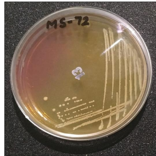
Fig 1: Isolation of S. aureus on mannitol salt agar from raw milk sample