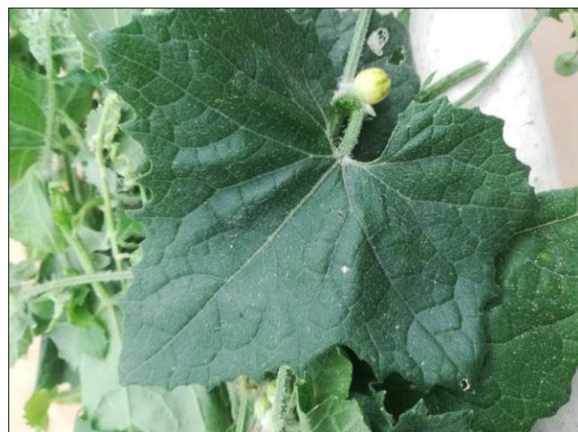
Fig 1: Plate 1; Mukia maderaspatana herb

The qualitative phytochemical analysis of aqueous and ethanolic extracts of Mukia maderaspatana herb leaves and whole plant was done by using the methods of Trease and Evans (1983) [36] and Kokate et al. (1990) [13] at the laboratory of Ethno Veterinary Herbal Research Centre for Poultry, Veterinary Clinical Complex, Namakkal, Tamil Nadu.