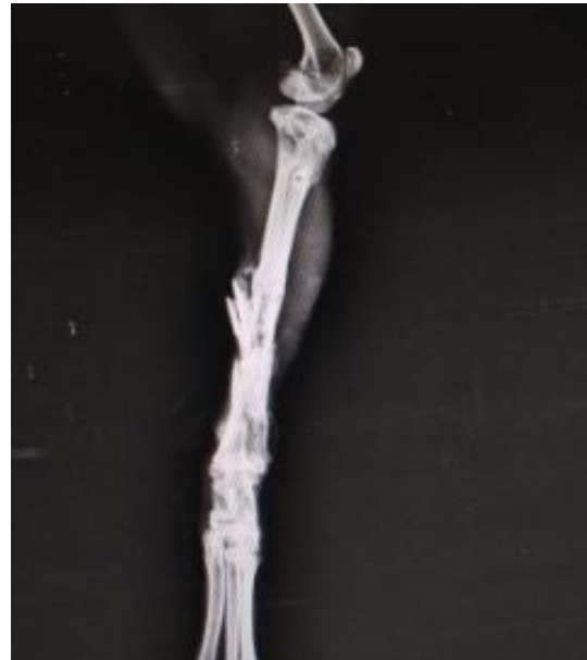
Fig 4: Radiograph after complete healing