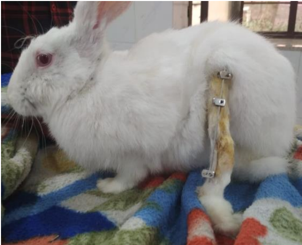
Fig 2: (Rabbit after transarticular ESF)