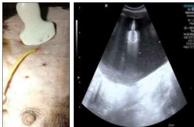
Fig 3: Ultrasound guided insertion of Foley's catheter (b) balloons inside urinary bladder