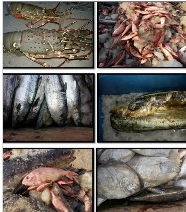
Fig 1: Catch composition