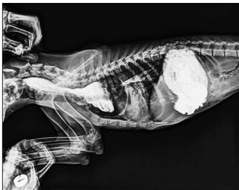
Fig 1: Showing contrast radiography of the oesophagus revealed contrast material accumulating in the oesophagus at the thoracic inlet and cranial to the heart base

The PRAA is most frequently diagnosed in young large-breed dogs. As, medical treatment was unrewarding, surgical ligation and transection of the ligamentum arteriosum was the only recommended method of treatment (Koç et al. , 2004; Kim et al. , 2006; Fossum, 2013 and Morgan & Bray, 2019) [4, 3, 2, 5]. Early diagnosis and surgery associated with good prognostic indicator (Muldoon et al. , 1997; Ve et al. , 2017 and Morgan & Bray, 2019) [6, 7, 5]. Hence successful surgical management of aforementioned case associated with early presentation, proper surgical intervention and adequate post-operative care.