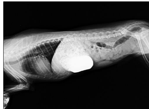
Fig 3: Showing radiograph after 04 months with complete resolution of PRAA