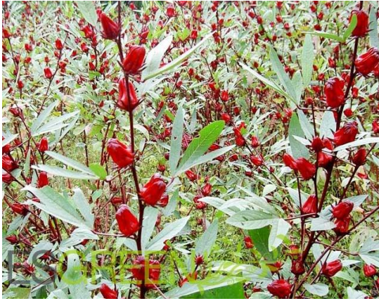
Fig 4: Hibiscus sabdariffa

evaluation of green tea yoghurt. Adv. life Sci. 2014; 3(2):70-73.