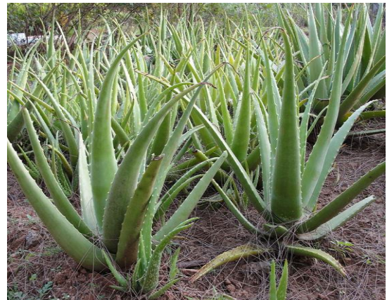
Fig 2: Aloe barbadensis