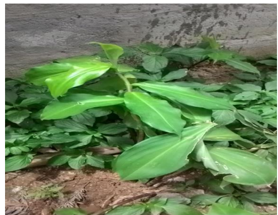
Fig 3: Costus igneus