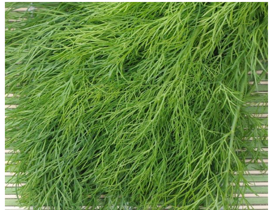
Fig 1: Anethum graveolens