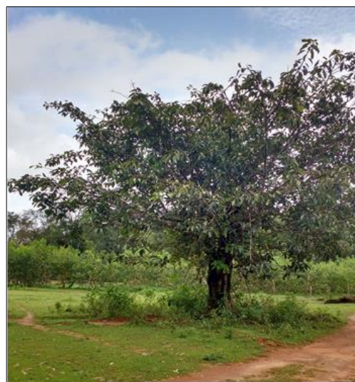
Fig 2: Ficus tsjahela tree