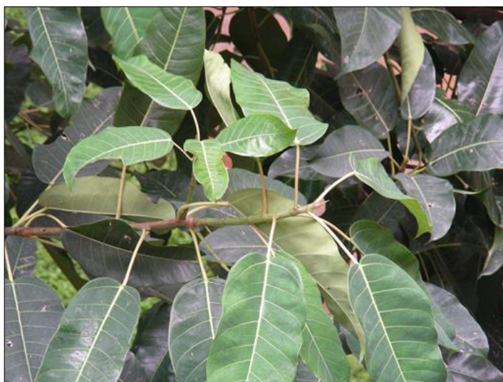
Fig 1: Ficus tsjahela leaves