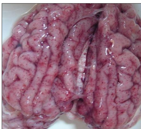
Fig 5: Petechial and extensive hemorrhages in the brain of Malnad Gidda cattle died due to toxicity of Ficus tsiela

with erect ears, widely opened eyes and nostrils. This was progressed with generalized tonic and clonic convulsions with paddling of all the limbs in many affected animals. Due to rigidity of the limb muscles, the animals could not lay down properly and got into a dog sitting posture. Malnad Gidda cattle with Ficus tsiela toxicity exhibited other clinical signs like anorexia, excitement, twitching of palpebral muscles, frequent involuntary jaw movements, anxiety, opisthotonos, inanimate object biting etc were similar to that of the clinical signs in other neurotoxic plants like Ficus tsiela and Ficus tsiela toxicity exhibited by affected animals as reported earlier (Rajan et al. , 1986; Nair et al. , 1985, 1987, 1997 ; Shridhar, 2017) [20, 15, 16, 17, 26]. Physical symptoms, which occur include excessive salivation, laboured breathing and intermittent tonic convulsions in the present study compared to Ficus tsiela toxicity (Rajan et al. , 1986; Nair et al. , 1985, 1987) [20, 15, 16] except frequent bellowing in contrast to the observations of clinical signs in the present