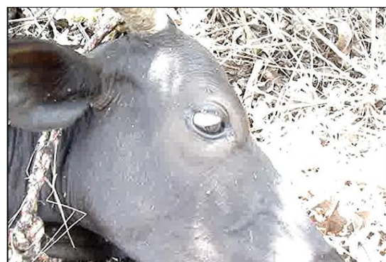
Fig 3: Clinical signs of Ficus tsjahela toxicity in a Malnad Gidda cattle