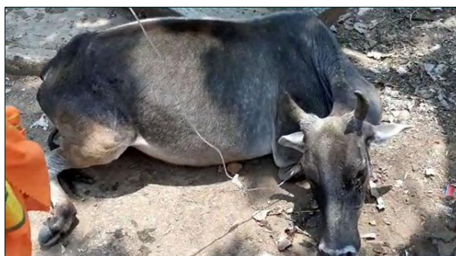
Fig 4: Malnad Gidda cattle recovering the after toxicity

The temperature, heart rate, pulse rate and respiratory rate were recorded timely. In the regular interval of 24, 48, 72 and 96 h following the onset of the signs of toxicity, blood samples from the affected cattle were drawn. The blood was also drawn from few unaffected Malnad Gidda cattle belonging to both sex to serve as control for comparison.