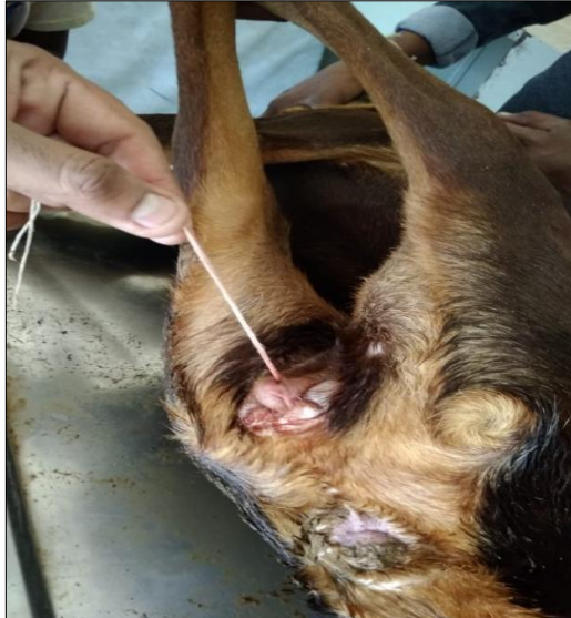
Fig 8: Purse string suture of vulva