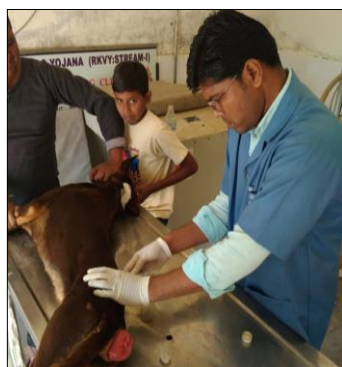
Fig 4: Lumbo-sacral epidural anesthesia using 1% Lignocaine hydrochloride