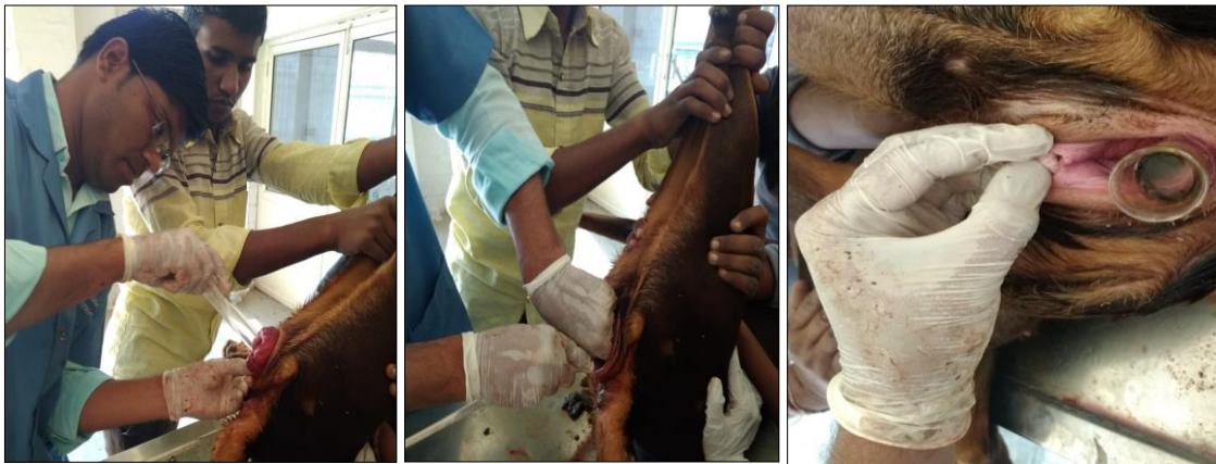
Fig 7: Use the glass tube to reposition and replacement of mass by uplifting the posterior region of bitch