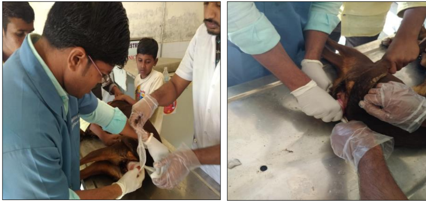
Fig 6: Applying a bandage and squeeze the mass by palm pressure