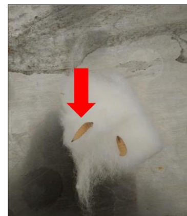
Fig 5: Removing the maggots from vaginal wound