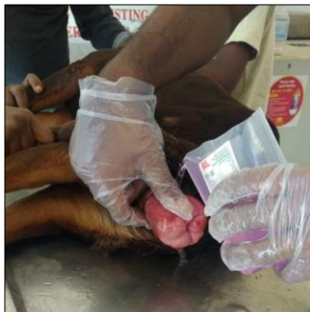
Fig 3: Washing of prolapsed mass with mild antiseptic solution of KMnO_4