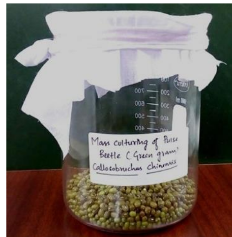
Fig 1: Mass culturing of C. chinensis

Mean of 3 replications, Values in parenthesis are square root transformed, Values with various alphabets differ significantly