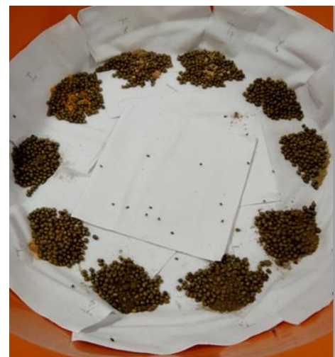
Fig 2: Orientation Preference test (Free- choice Condition)