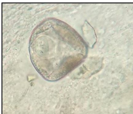
Fig 4: Triangular shaped Moniezia expansa egg with hexacanth embryo (40X)