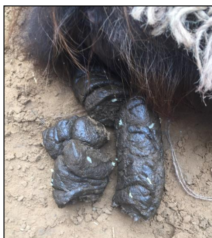
Fig 1: White coloured cooked rice grain type of crumbs in faeces

Four Murrah buffalo calves with age ranging from 2.5 to 5 months were reported to Government Veterinary Hospital, Bhagwi, Charkhi Dadri (Haryana) out of which two calves were with a complaint of constipation and the remaining two calves were with a complaint of explosive diarrhoea and emaciation since 4-5 days. White coloured cooked rice grain type of crumbs was observed in the gross faecal examination of the calves (Fig. 1).