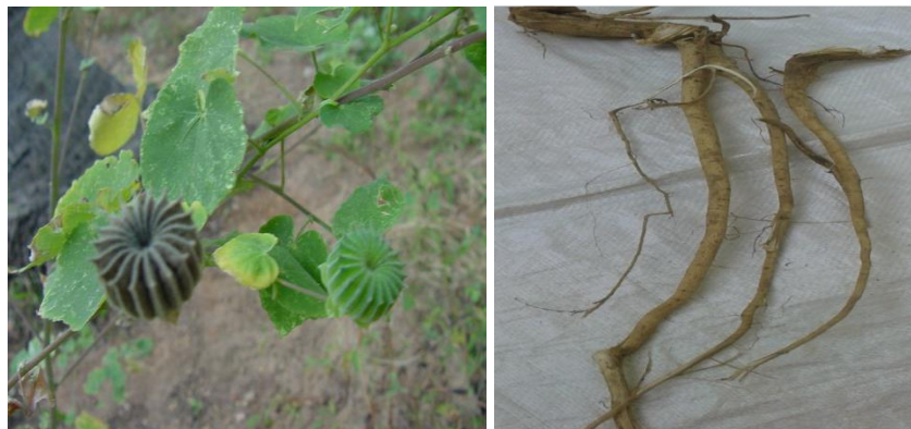
Fig 1: Photograph of Fruit with Leaf and Root of Atibala