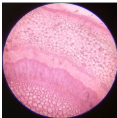
Fig 9: Anatomy of Stem

Anatomy of Leaf: Epidermis single layered and contains sunken stomata. Below the epidermis there is 1-2 layers of water storage cells. Lower epidermis also possesses sunken stomata. Mesophyll is differentiated into upper palisade, which is biseriate with abundant chloroplast and lower spongy parenchyma with loosely arranged cells. Vascular bundles are conjoint, collateral, endarch and open. Bundle sheath is sclerenchymatous.