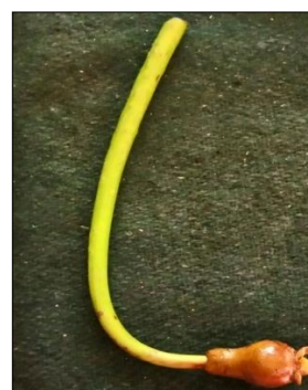
Fig 6: Fruit With Persistent Calyx of Rhizophora Mucronata Lam.