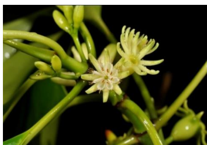
Fig 1: Inflorescence of Bruguiera cylindrica (L.) Bl.

Flowers: Greenish white, usually sessile, rarely middle flower Pedicellate. Calyx greenish white, short and top shaped. It opens into 8 pointed lobes at distal end and fused basally to form a prominent calyx tube, glabrous, enclosing the ovary, persistent. Petals as many as and alternating with the calyx lobes, free, shortly stalked, greenish white, hairy with 2 to 3 bristles at their tip. Stamens 10, free, but in groups of two, inserted in the folds of each petal, anther basifixed. Ovary semi-inferior, inserted and fused with calyx cup, 2-celled, ovules 2 in each, pendulous, style long, filiform, stigma bifid.