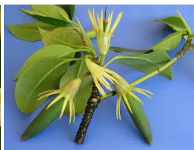
Fig 3: Persistent Calyx of Bruguiera Cylindrica (L.) Bl.