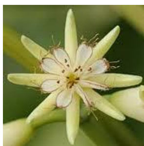
Fig 2: Flower of Bruguiera cylindrica (L.) Bl.