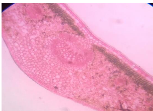
Fig 8: Anatomy of Leaf Rhizophora mucronata Lam.

Anatomy of Stem: Single layer of epidermis consist of thick cuticle. Hypodermis composed of 4-5 layers of collenchyma cells with tannin deposition. Outer cortex consist of regularly arranged parenchyma cells with inter cellular space, inner cortex consists of 6-7 layers of closely packed parenchyma cells, in between these cells sclerids are present and also certain chemical deposition. Endodermis and pericycle are single layered. Xylem and phloem well developed, endarch, conjoint, collateral and open. Lignified cells are seen around xylem vessels. Pith is large with water storing cells.