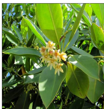
Fig 4: Inflorescence of Rhizophora Mucronata Lam.

Flowers: Perfect, yellowish white, tetramerous; calyx green with 4 thick fleshy, valvate, deeply lobed, pale yellow and persistent in fruit. Petals 4, lanceolate with densely hairy margins and somewhat longer than the calyx lobes, filaments short; anthers linear and basifixed. Ovary half inferior, inserted within and fused with calyx cup, bicarpellary syncarpous with 2 ovules in each cell, pendulous, style short, conical, stigma bifid.