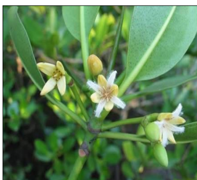
Fig 5: Flower of Rhizophora Mucronata Lam.