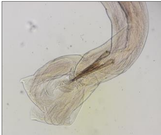
Fig 2: H. contortus male bursa with 'Y' shaped dorsal ray