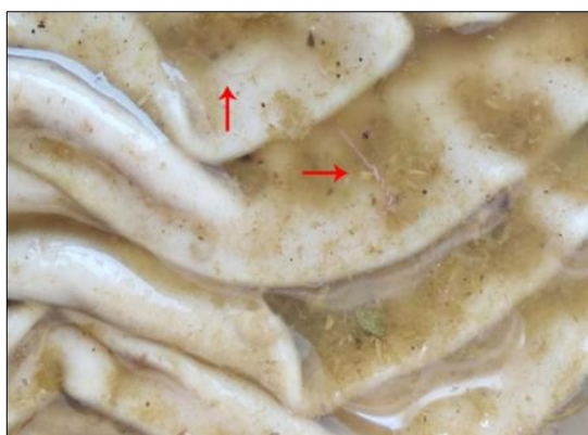
Fig 1: Abomasum showing the adult H. contortus

The present study identified the cysteine protease hmcp5 gene in male H. contortus . Presently we do not have any information on cysteine protease genes other than this, if any, need to be investigated in the South Indian isolates or strains. Molecular characterization, expression and functional studies of different cysteine protease genes in Haemonchus contortus are required for future studies.