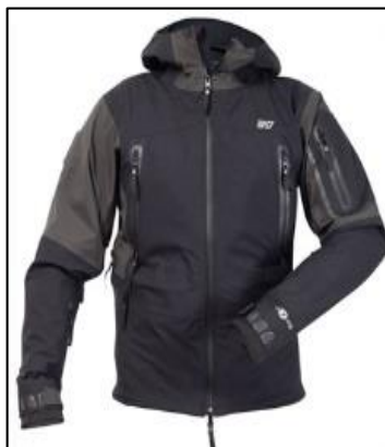
Fig 2: Aerogel-based fire protective clothing

Flame retardant textiles: Aerogels can also be used to impart flame retardant finishes to fabrics for eg. coatings of protective clothing using aero gels. Heat transfer by the gas phase could be avoided by evacuation. Evacuated Si-aerogel showed reduced thermal conductivity of one half. Aerogels can also be utilised for development of novel anti-wetting coatings on textiles such as silica-biopolymer coatings to render highly hydrophobic characteristics to the fabrics: Chunxin. 2016 [4]. Conducted a research aerogel-based fire protective clothing and analysed the insulation material and performance of the active fire protective clothing, and also analysed the application of aerogel in clothing as new nano insulating material. The results showed that the weight and the thickness of the fire protective clothing, in which the SiO 2 aerogel composite was used, were proved to be lessened by more than 70% under the similar promised of thermal protective performance (Fig. 2).