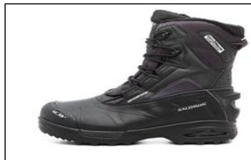
Fig 3: silica aerogel composite in footwear

Zrim et al. 2015 [12] conducted a research on properties of laminated silica aerogel fibrous matting composites for footwear applications. They described lamination method of commercially produced silica aerogel composite and investigated its suitability for thermal insulation within protective footwear applications (Fig. 3) for severe cold and extreme high-altitude environments. A silica aerogel composite was used with a thickness of 2.7 mm and mass per unit area of 500 gm -2 . A solid 5 µm thick membrane was used, reinforced with an abrasive resistant polyester knitted fabric.