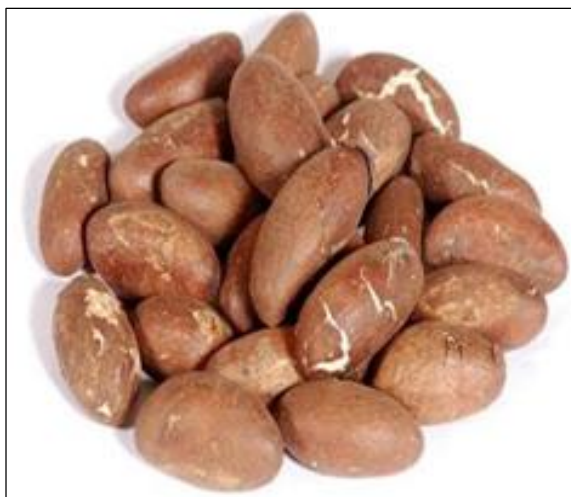
Fig 1: Garcinia kola Heckel