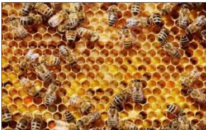
Fig 2: Honey comb

Two main types of honey termed the apiary and forest honey exist. The apiary type are produced by the honey bees Apis carana indica and Apis mellifera collected by modern extraction method and free from foreign materials.