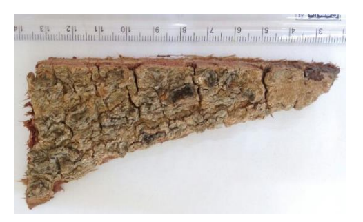
Fig 4: Bark of Nimba