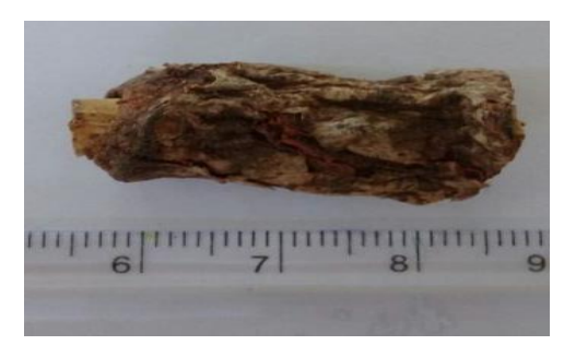
Fig 6: Root of Sariva