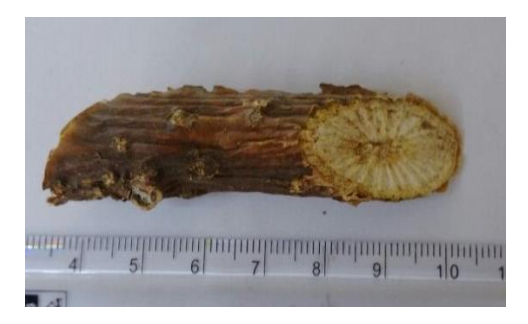
Fig 1: Stem of Amruta

Amruta Abheervadi drops were prepared by using different parts of medicinally important plant such as Amruta (stem) (Fig. 1), Abheeru (tuberous root) (Fig. 2), Patola (leaves) (Fig. 3), Nimba (bark) (Fig. 4), Raktachandan (heartwood) (Fig. 5) and Sariva (root) (Fig. 6) in equal quantity of 200 grams each. The above mentioned plant materials were taken and made into coarse powder and soaked overnight in 10 parts of water. Next morning, the soaked drugs were subjected for the distillation process. The vapors are condensed and collected in a receiver. In the beginning, the vapors consist of only steam and may not contain the essential principles of the drugs. It should therefore be discarded. The last portion also may not contain therapeutically essential substance and should be discarded. The final product was in the form of drops (Fig. 7). This method of preparation of Arka is followed according to The Ayurvedic Formulary of India.