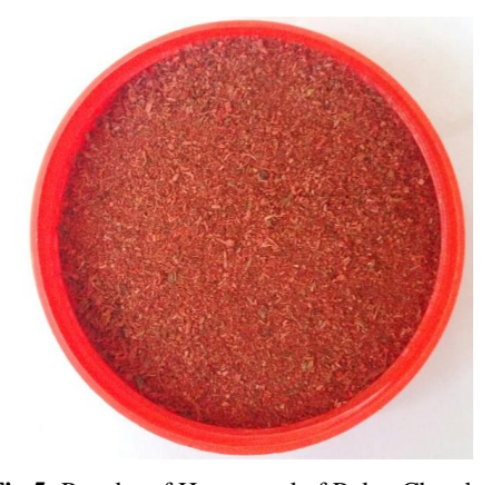
Fig 5: Powder of Heartwood of Rakta Chandana