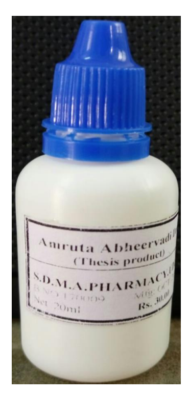
Fig 7: Amruta Abheervadi Drops