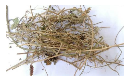
Fig 3: Leaves, fruit, stem of Patola