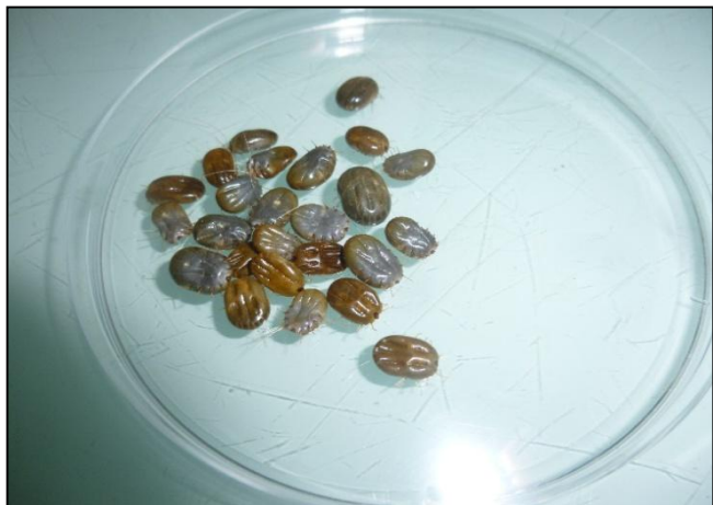
Fig 2: engorged females of R. (B.) microplus

For each control solution and each of the acaricidal test solutions and starting with the lowest concentration, each group of ticks was placed directly into a container containing 10 ml of the treatment solution. The whole was stirred vigorously and left for 5 minutes. After this latency, the gorged ticks were removed from the mixture and then placed on a clean paper towel for drying. After drying, all ticks in each group are placed in a dry box clogged with a very fine mesh and labeled. The ticks are placed in an oven at a temperature of 27-28 °C and a relative humidity of between