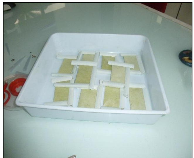
Fig 1: Pouch after deposition of larvae

The Larval Packet Test (LPT) was used to determine the acaricidal effect of the ethanolic extracts of the leaves of four (4) plant species on the larvae of R. (B.) microplus . Concentrations of 25 mg/ml, 50 mg/ml, 100 mg/ml, 200 mg/ml and 400 mg/ml of each extract of the four plants were evaluated at the rate of three replicates per plant extract. For this purpose, pockets of filter paper whatmann N°1 (7.5cm × 8.5cm) were made, with 3 pockets per concentration and 1 control pocket for each ethanol extract. Thus, in a pipette, 0.67 ml of each solution was taken to impregnate each of the corresponding pockets which will then be for two hours under the hood. The four control pockets received the same volume of control solution. The lateral edges of each of the pockets were sealed with two clasps (Figure 1). Approximately 100 to 150 larvae of 14 to 21 days were gently transferred to each pouch using a brush.