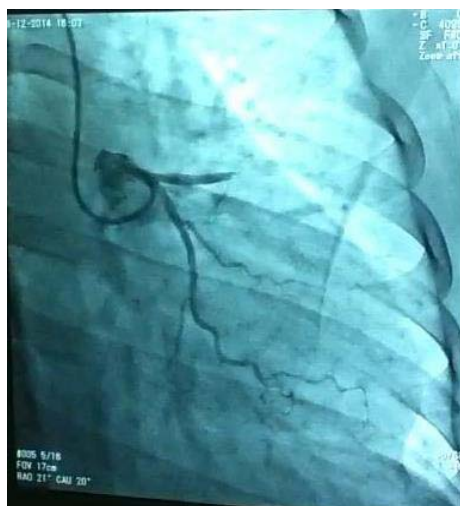
Fig 1: Coronarography of the patient D. before stenting.

After the PCI chest pain has completely ceased; by means of ECG examination the ST-segment resolution was defined as 80%. The patient's general condition was satisfactory with regular pulse of 96 bpm, clear heart tones and respiratory rate of 17/min.