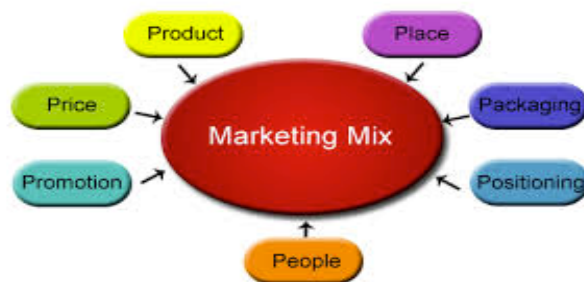
Fig 1: Marketing Mix

Pakistan Pharmaceutical market has changed a lot in last decade or so due to the increase pressure of generic products. In this highly competitive market field force skills enhancement and right strategies are key factors for success. In addition to that if you want to be successful in current situation pharmaceutical marketers should generate new ideas and strategies rather than dependent on old-fashioned trend [16].